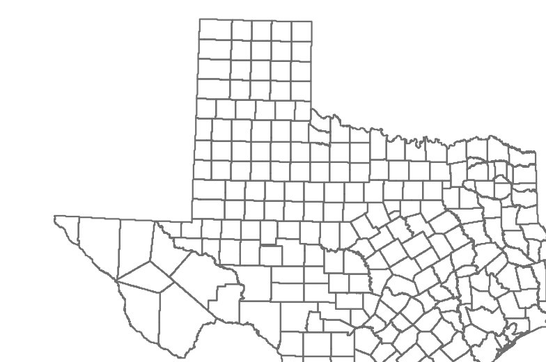
Cameron County, Texas